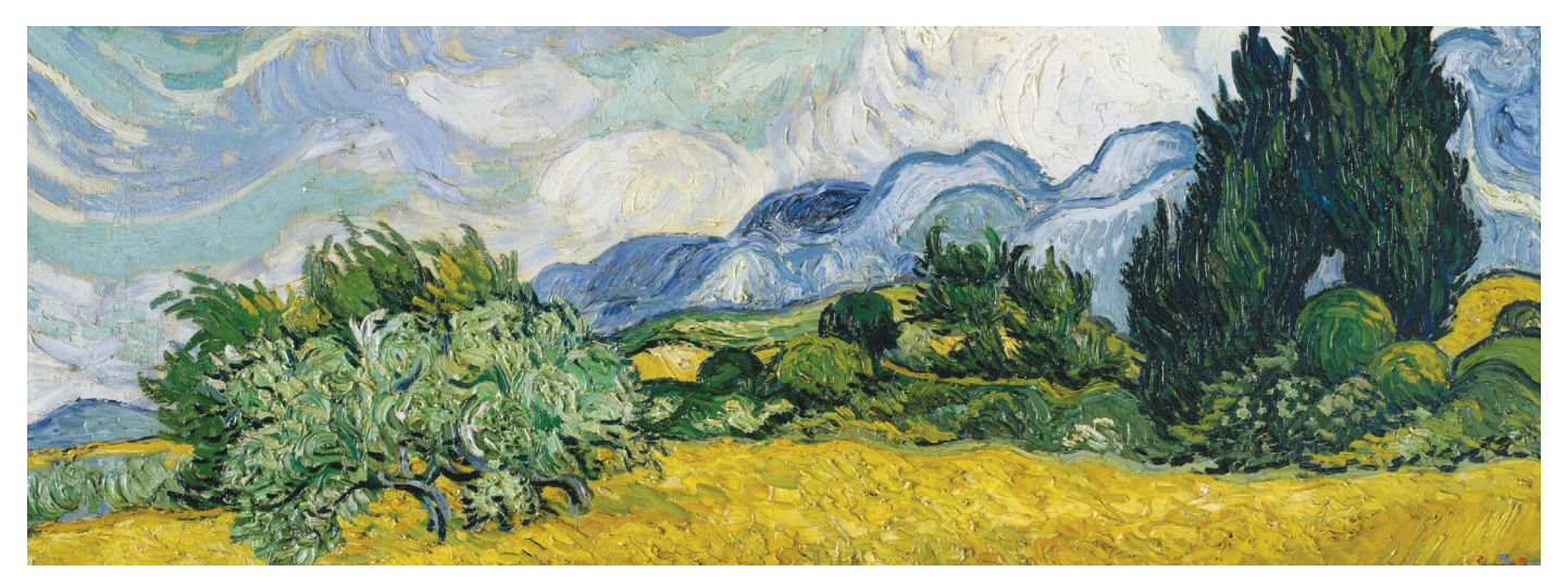
Vincent van Gogh, Wheat Field with Cypresses, 1889.